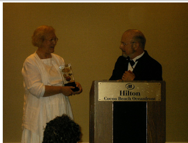
Joe Haldeman receiving his Grand Master Award from Connie Willis