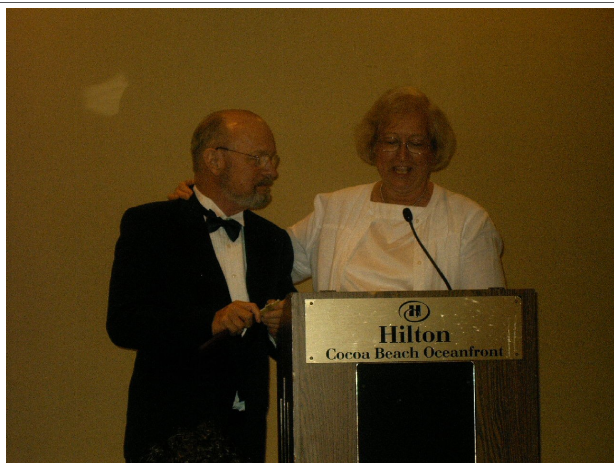
Joe Haldeman receiving a slide rule from Connie Willis