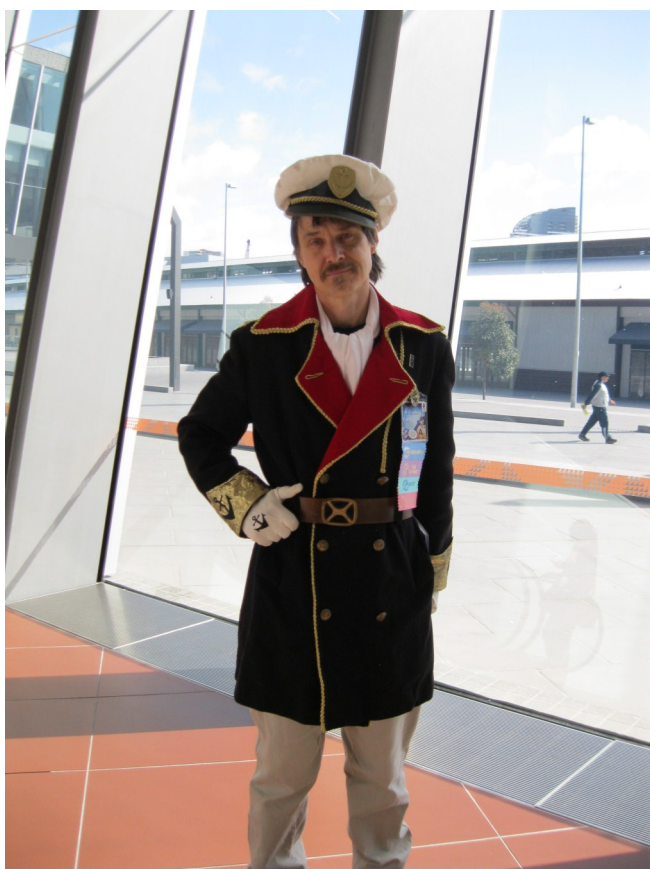
Left: Hall Costumer- Captain Ryu Hijikata from Space Battleship Yamato