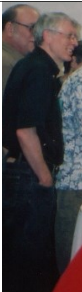
Michael Bishop at the OASSI 20 cake cutting ceremony.